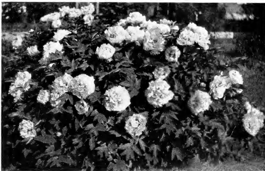
PÆONIA ARBOREA (Tree Peony) BANKSI , 10 years old, on its own roots, 4 feet high, 15 feet in circumference, bore 125 double, flesh-pink flowers in 1929.— Oberlin Peony Gardens, Sinking Spring, Pa.